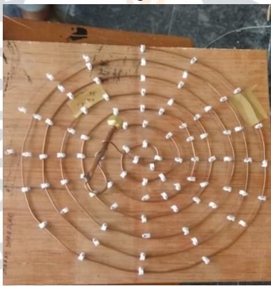
Fig. 3. Photographic View of Spiral Capillary Tube

We need to change the tube very often in our project in order for the capillary tube to be easily attached and removed. Here one end of the capillary tube is swept into a copper tube, a flange is grooved at the other end of the tube and flare nut for easy access. Another end is the evaporator's suction after having a spiral capillary connoted on an end-hand operated valve. This is centred at the point between x and y.