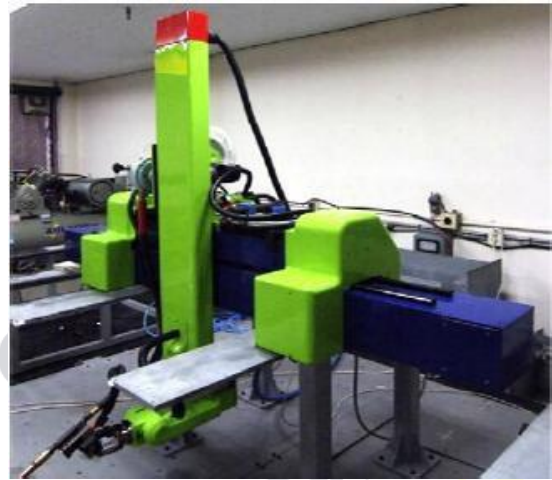
Figure 1: RRX4 Mobile Welding Robot [8]

Control system in robotic arc welding is categorized in two; open-loop system and closed-loop system. Open loop system is the basic concept of any control system in welding process, while closed-loop system is the improved system. There are optimal control, adaptive control, and intelligent control.